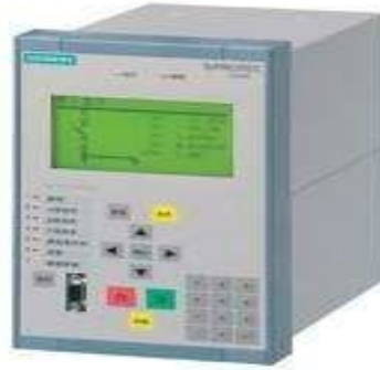
Figure 1. Digital relay protection device